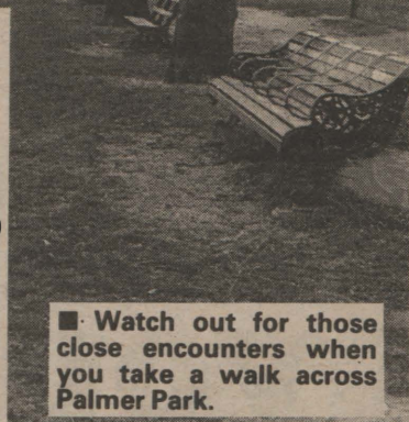
■ Watch out for those close encounters when you take a walk across Palmer Park.